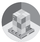
Kitting and Subassembly