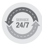
Dedicated Contract Transportation